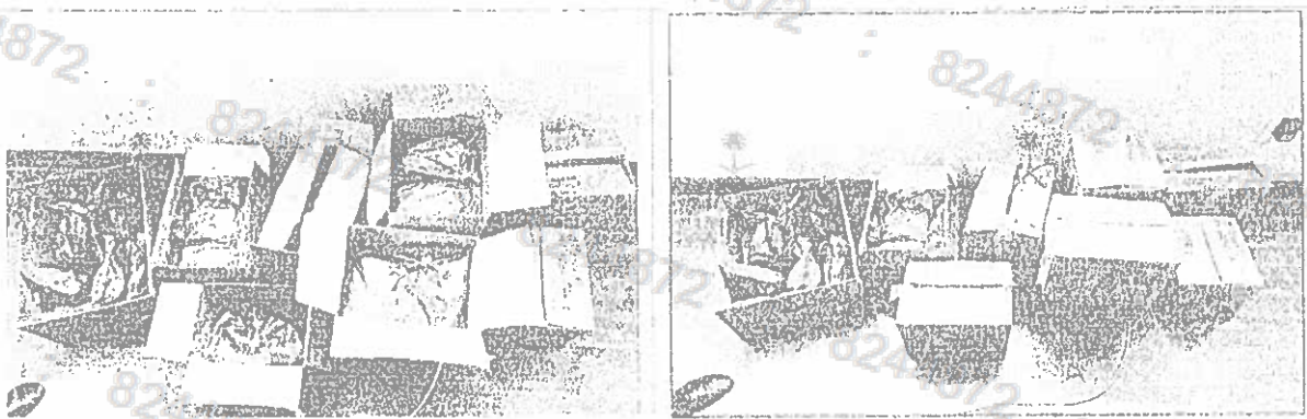
Photos 1-2: Polypropylene bags with seals neatly packed into a cardboard box. Фотографии 1-2: Полипропиленовые мешки с пломбами, расфасованные в гофрокартонную коробку.

На момент проведения инспекции продукт был упакован в полипропиленовые мешки. Продукт, предназначенный для экспорта, хранился на складе клиента в г. Бишкек по ул. Токтогула 247/12. В ходе инспекции представителем SGS было визуально проверено целостность упаковки с продуктом.